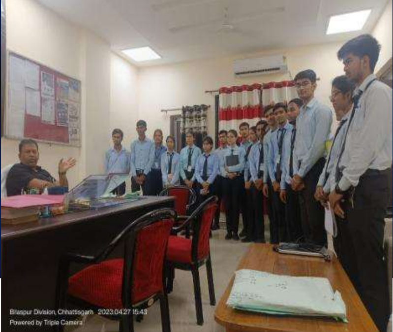
Bilaspur Division, Chhattisgarh 2023.04.27 16:43 Powered by Triple Camera