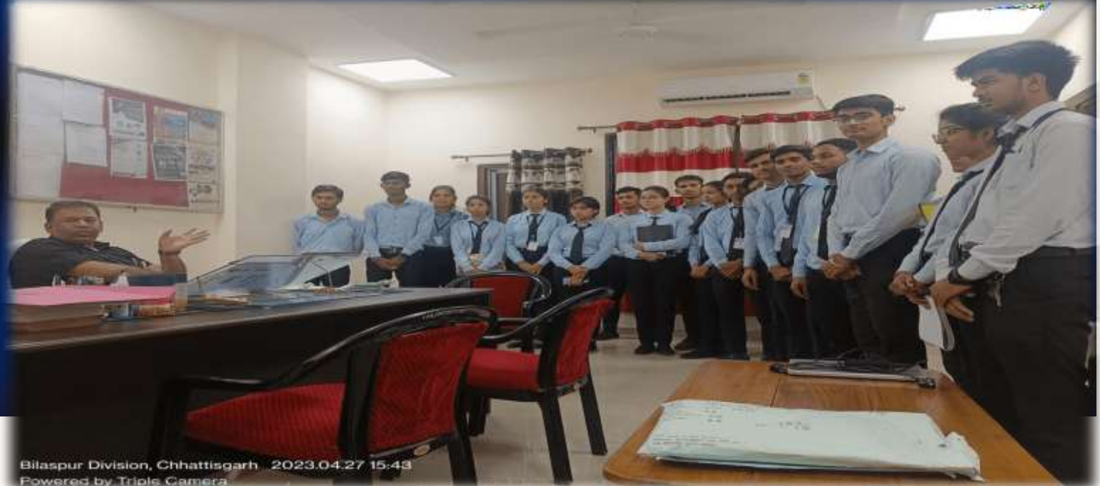
Bilaspur Division, Chhattisgarh 2023.04.27 15:43 Powered by Triple Camera