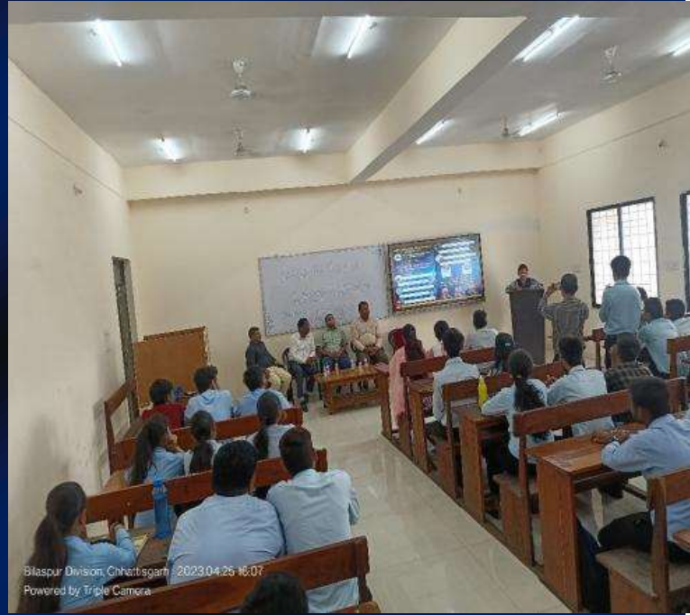
Bilaspur Division, Chhattisgarh - 2023.04.25 16:07 Powered by Triple Camera