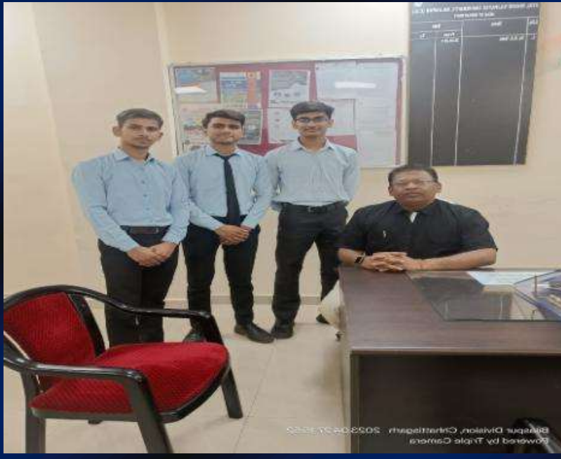
Bilaspur Division, Chhattisgarh 2023.04.27 13:55 Powered by Triple Camera