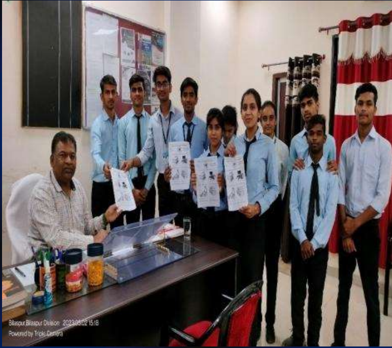
Bilaspur Bilaspur Division - 2023.04.02 15:18 Powered by Triple Camera