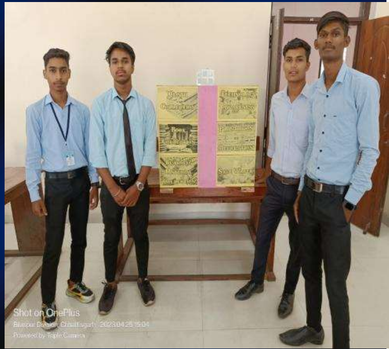
Shot on OnePlus Bilaspur Division, Chhattisgarh - 2023.04.25 15:04 Powered by Triple Camera