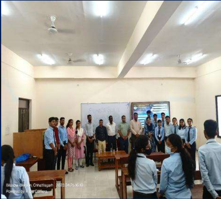
Bilaspur Division, Chhattisgarh - 2023.04.25 16:10 Powered by Triple Camera