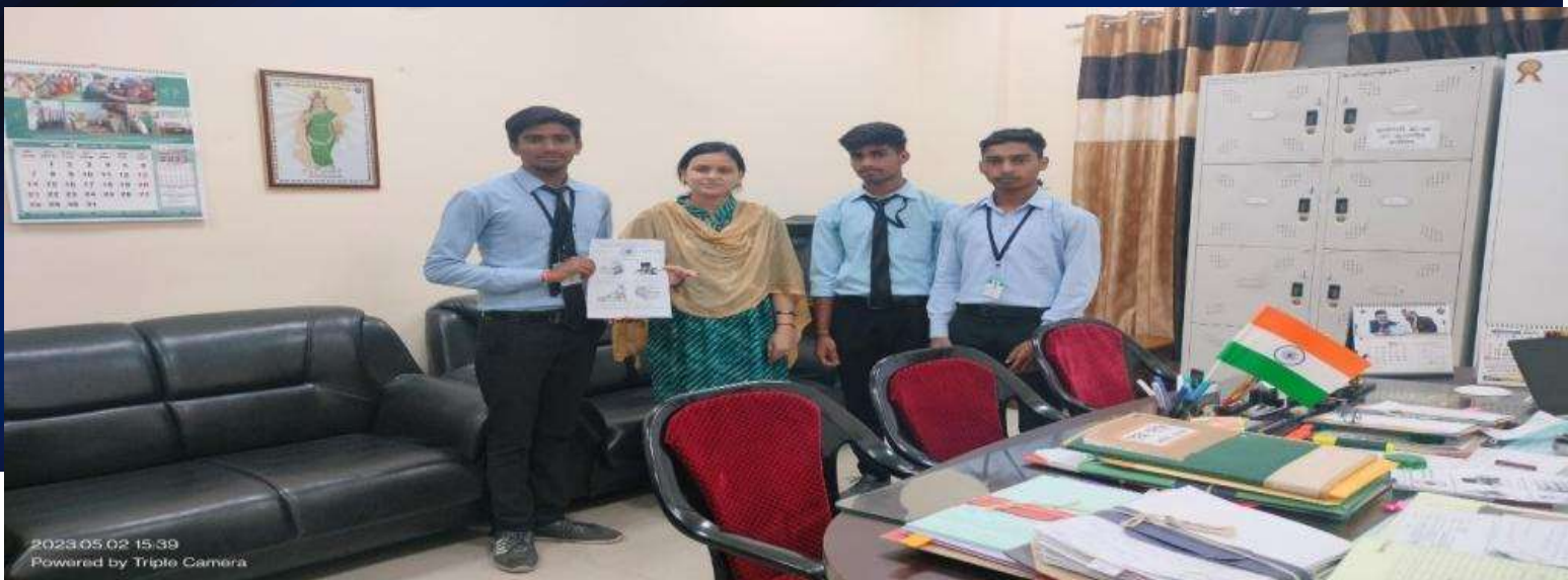
2023.05.02 15:39 Powered by Triple Camera