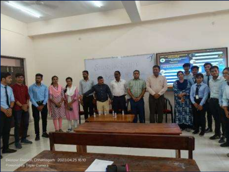
Bilaspur Division, Chhattisgarh 2023.04.25 16:10 Powered by Triple Camera