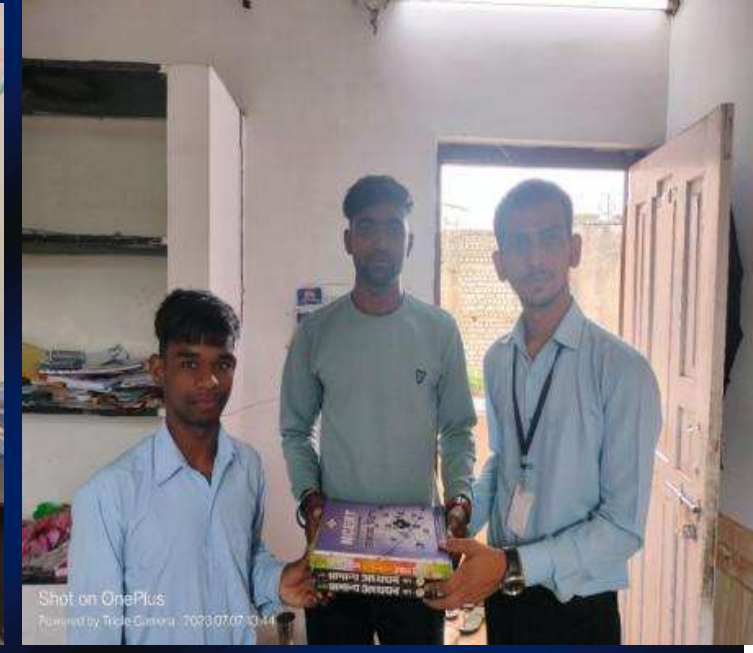
Shot on OnePlus Powered by Triple Camera 2023.07.07 13:44