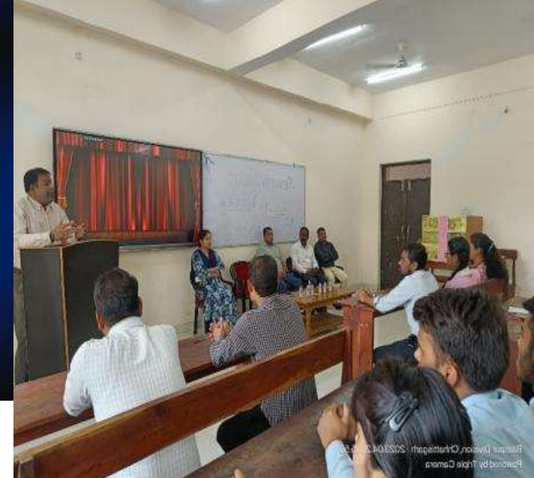
Bilaspur Division, Chhattisgarh 2023.04.27 16:43 Powered by Triple Camera