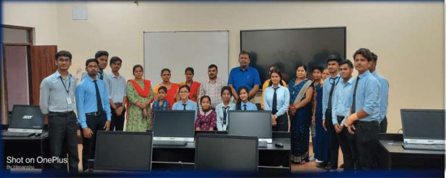
Shot on OnePlus By Himanshu